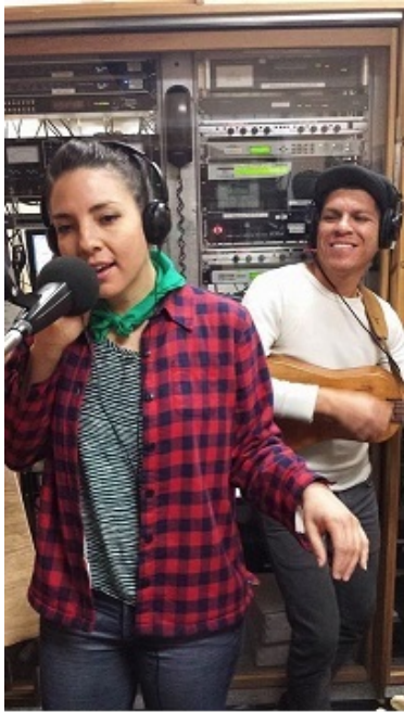
Las Cafeteras Performs Live on Radio Bilingüe

As Radio “Bilingüe,” some talk programs are bilingual and some music programs are in English or languages other than Spanish. Radio Bilingüe’s unique public affairs programs include Rockin’ da House , mixing music and information for the bilingual English-Spanish youth demo, and La Hora Mixteca , featuring music and information in Spanish and indigenous Mixtec, a major population group in farm worker communities of the United States.