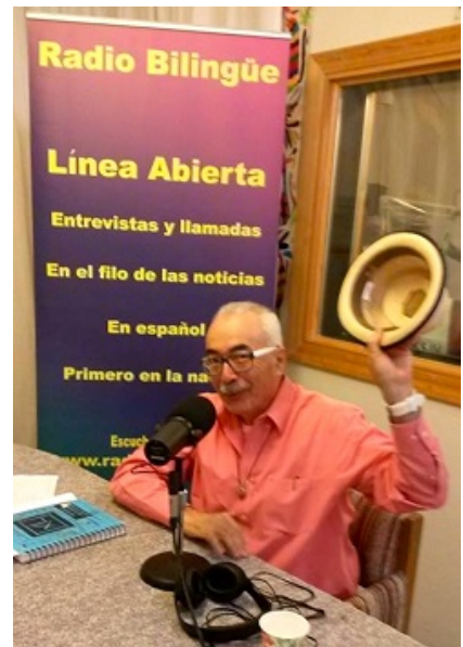
Juan Felipe Herrera

Thousands of past Línea Abierta programs are available online.